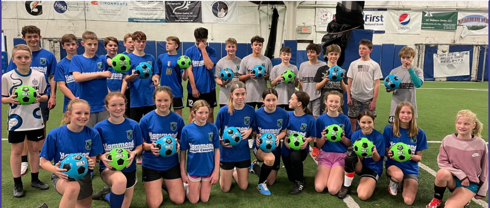
River City Giving Back to Community