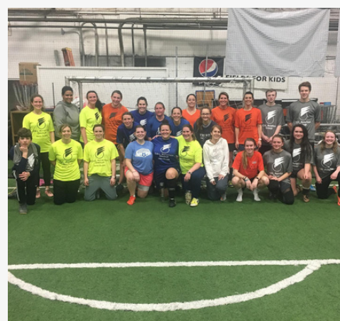
Adult Men's and Women's Leagues