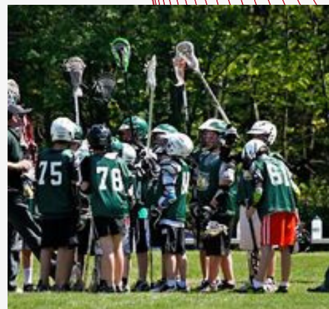
Eastern Maine Lacrosse Clinics