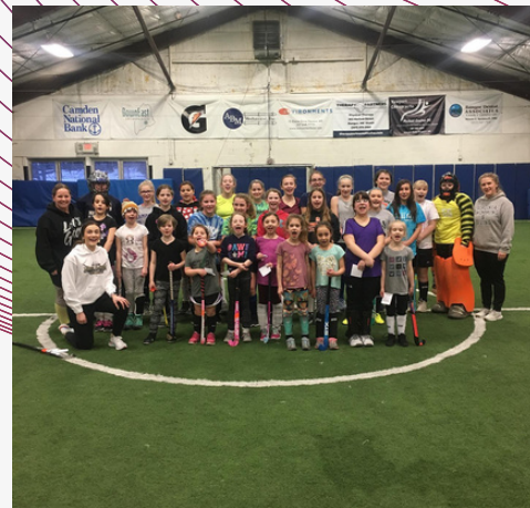
Field Hockey Camps and Clinics